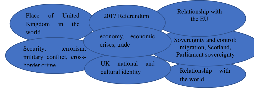
Figure 1. Macro-topics in "Let us, Great Britain, stand tall and lead"

Examining the 6000-word speech, it is concluded that the major macro-topics, and sub-topics covered can be summarized as follows: