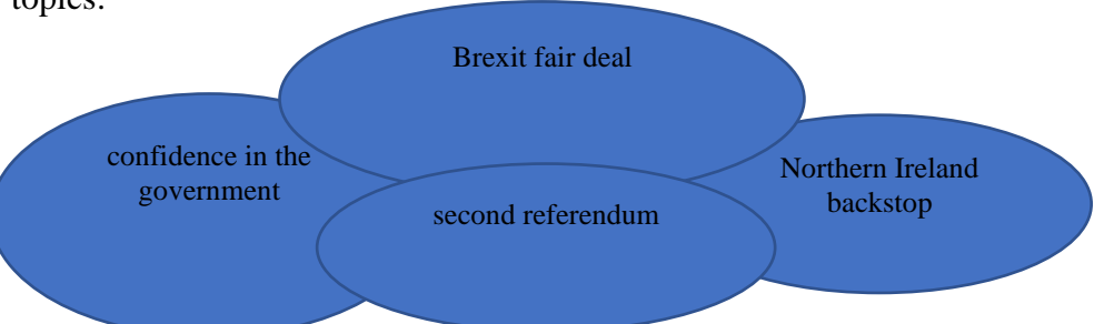
Figure 3. Macro-topics in speech# 3.

evoked. The main topics are those that relate to the duty of the Government to lawfully implement Brexit. Figure 3 summarises the main topics: